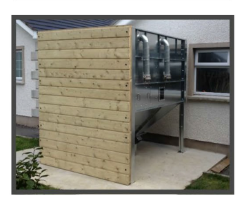
Treated timber cladding panels to help give the silo a more natural look