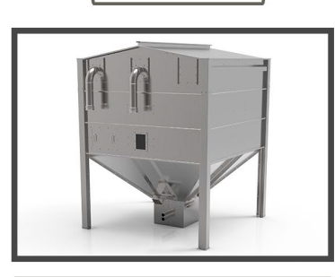
Optional roof design for use in areas that experience high snow loads