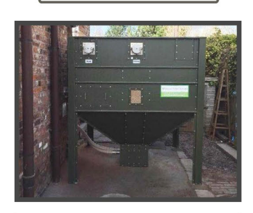
PVC coated finish gives the product a 30 year outdoor life